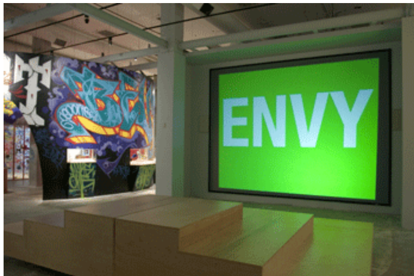
Installation view of Consider This ...