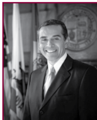
ANTONIO R. VILLARAIGOSA MAYOR